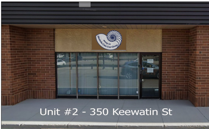
Unit #2 - 350 Keewatin St

If you show up in person you will be treated to more beverage choices than we've offered in over a decade: coffee, tea, and pop, as well as cookies. And parking is free, copious, safe, and just a handful of feet from the door.